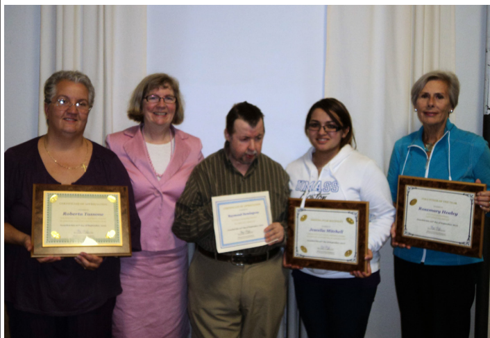
Pictured below, left to right: